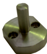
Cutting Die Adaptor