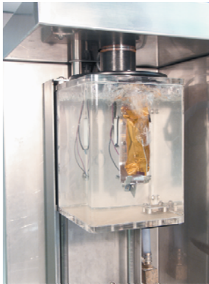
Bubbles emanating from a leak

By analysing these results, it is clear to see where the heat sealing on line is not performing adequate seal layer fusion. Adjustments can then be made easily to amend the temperature or pressure of the sealing bars to ensure seal integrity of finished product.