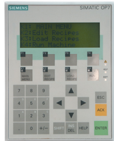
Programmable Control Panel