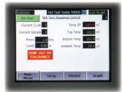
Touch Screen Operation

10-11 Colrado Court, Hallam, Victoria 3803 Australia.