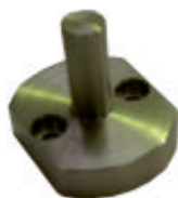
Cutting Die Adaptor

Can be used with the following Cutting Dies