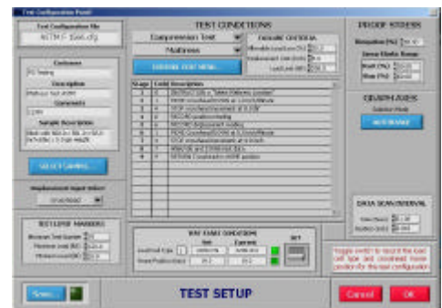
Sample Test Configuration Screen

The Software Program for the Universal Testing Machine is automatic. Once the Test Configuration menu has been programmed, “Start” button is pressed, initiating the test. The results of the test are displayed on the PC in real time. They can then be saved and/or printed for later use.