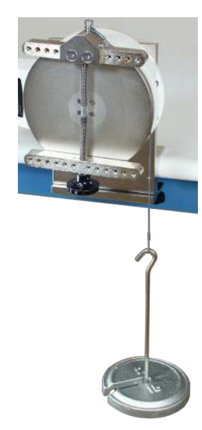
Calibration kit Complete set of brackets, cable, and hardware for calibration of any Series TT01 torque tester. Weights not available from Mark-10.