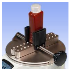
Flat jaws Set of rubber jaws for gripping square or odd shaped containers.