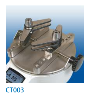
Adjustable jaws Rubber-edged arms may be independently repositioned to accommodate unique samples.