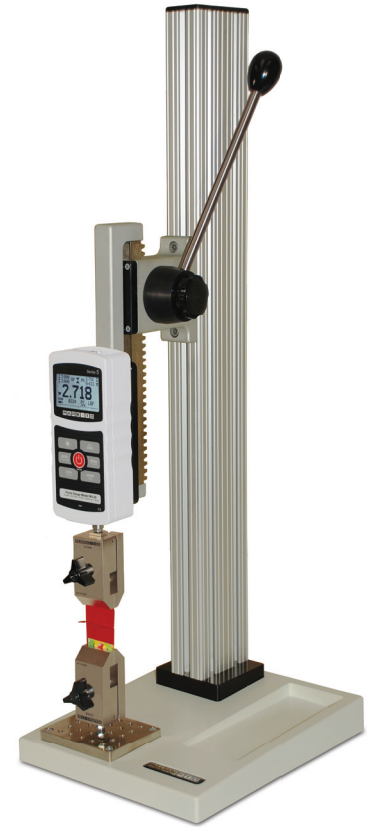
The TSB100 is shown with a Series 5 force gauge and G1008 film & paper grips